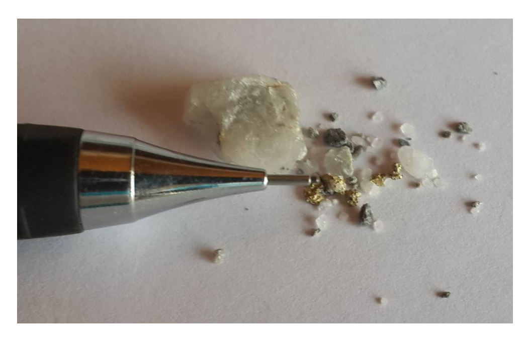
Figure 3: Coarse gold in RC chips at 65m from RCS540 on line 99750N returned 12.6 g/t Au

Visible coarse gold has been observed in RC chips from several holes (Figure 3).