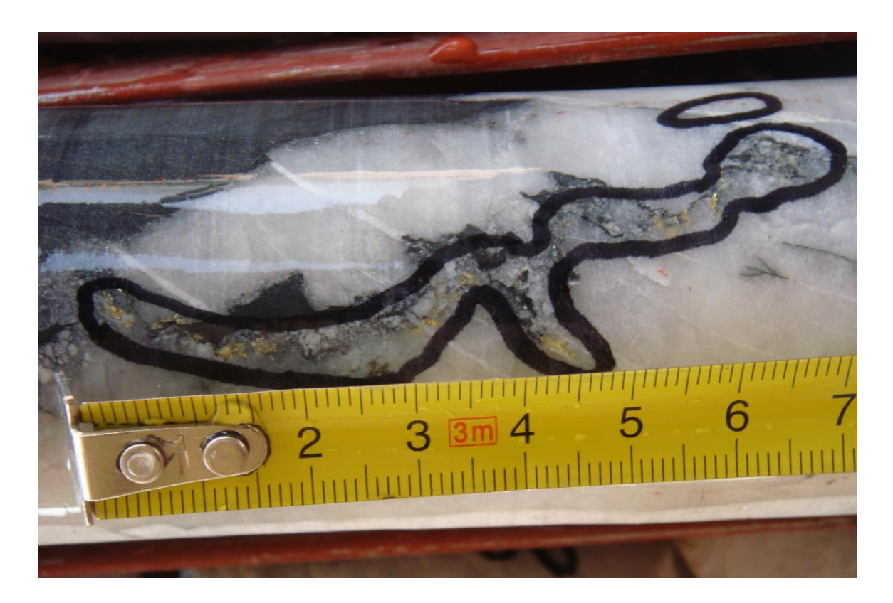
Figure 3 – DDM003 – Visible Gold