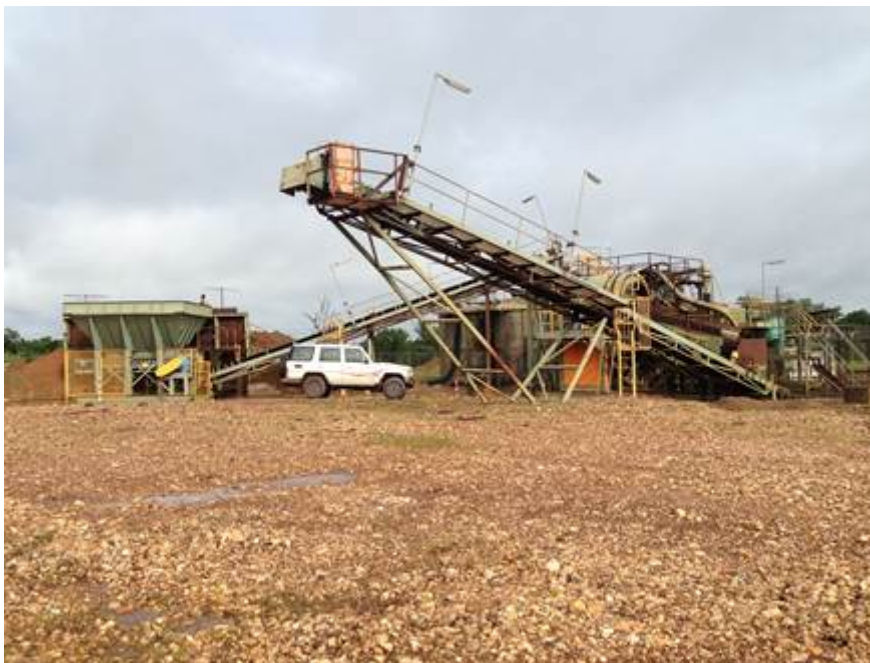
Figure 4 – Existing Gravity Plant

The existing processing plant and mobile fleet has been inspected and found to be in good working order. A comprehensive care and maintenance program has been in place for the processing plant and mobile fleet which has been regularly serviced. The mobile fleet has supported our exploration programs and continues to support early stage development activities. The gravity processing facility is operational and has been inspected as part of the current field activities (see Figure 4).