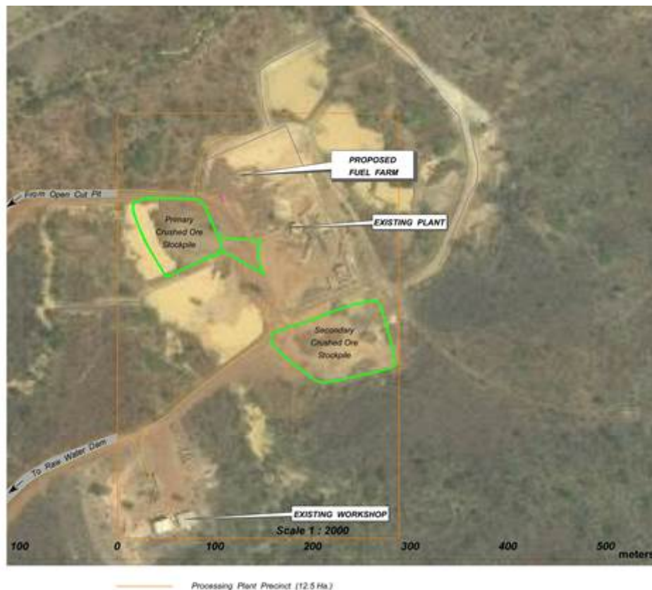
Figure 1 – Processing Plant Footprint