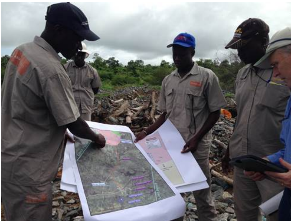
Figure 3 – Makabingui Mine Area Field Review by Development Team

A review of the mine layout has been undertaken incorporating preliminary feedback from recent field visits by Synergie Environmental, who are undertaking the Environmental & Social Impact Study. The Bassari geological team together with a representative of Australian Mine Design and Development (AMDAD) reviewed the proposed layout of the mining area (See Figure 3). Mining contractors were also briefed on the scope of work which will incorporate the mining activities, ore crushing and ore haulage to the processing facility.