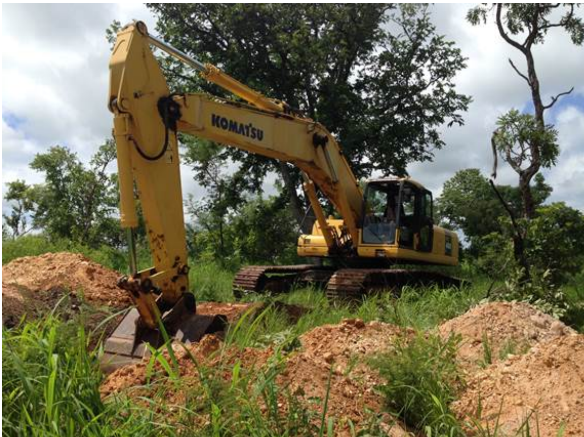
Figure 2 – Tailings Storage Facility Soil Sampling

Work has commenced on site excavating test pits within the area of the proposed tailings storage facility (TSF). Analysis of samples taken from the test pits will enable detailed design of the TSF wall to be undertaken. A total of ten pits have been sampled with test work being undertaken in Dakar. Utilising the PC450 excavator which is part of the larger mobile fleet owned by Bassari saved substantial cost in undertaking this work (See Figure 2).