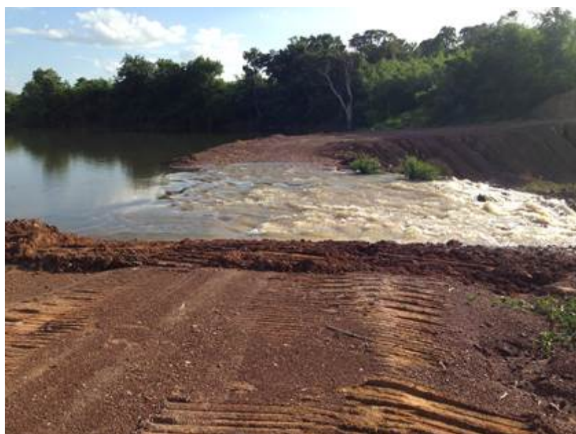
Figure 6 – Water Storage Dam Spillway