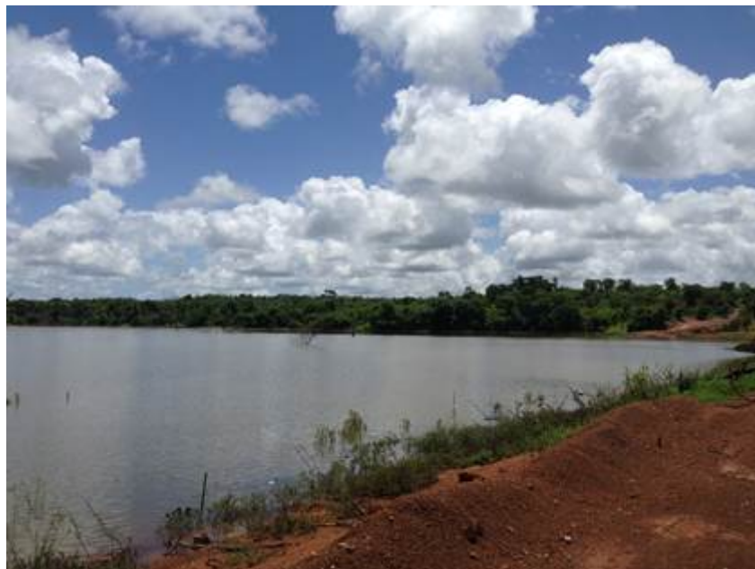
Figure 5 – Water Storage Dam

The existing water storage dam is full with the wet season commenced (see Figure 5 & 6). The rains will start to build up through the month of August and continue through September. A representative of Trevor Clark & Associates has inspected the dam and prepared a plan for remediation works and ongoing maintenance. There is ample water already available to both commission and operate the processing plant in the new year.