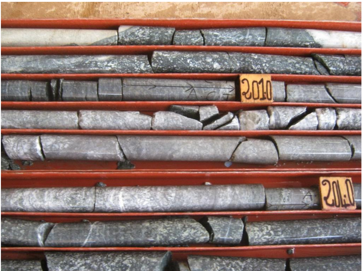
Figure 2 – Altered and Mineralised Drill Core – Hole RCS438D, Section 99,900N (Assays Pending)

Initial results include diamond drill holes RCS170D and RCS177D on Section 99,900N (Figure 3). Results from zones where visible gold was indentified in drill core include 4 metres @ 12.0 g/t gold from 319 metres, including 1 metre @ 47.2 g/t gold from 319 metres and 9 metres @ 0.9g/t gold from 382 metres with the lode remaining open down dip. Results from RCS432, reverse circulation drilling on Section 100,200N intersected a near surface lode of 2 metres @ 3.2 g/t gold from 40 metres.