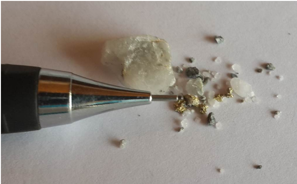
Figure 3: Coarse gold in RC chips at 65m from RCS540 on line 99750N returned 12.6 g/t Au

Visible coarse gold has been observed in RC chips from several holes (Figure 3).